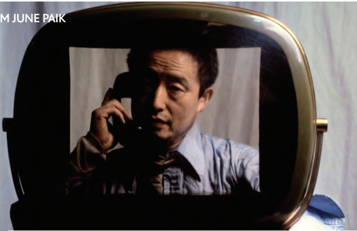
NAM JUNE PAIK

The father of video art and coiner of the term “electronic superhighway,” Nam June Paik was one of the most influential artists of the 20th century.